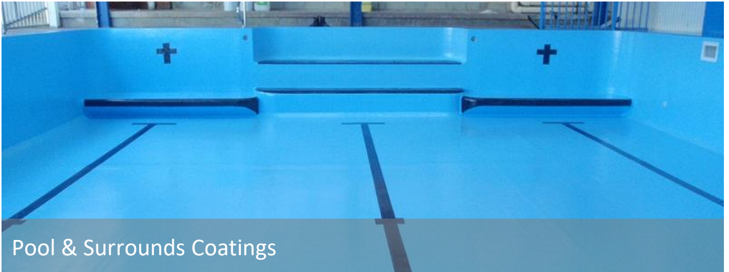
Pool & Surrounds Coatings